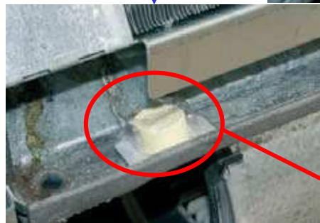
5. Insert 1 tablet close to the condensate discharge pipe