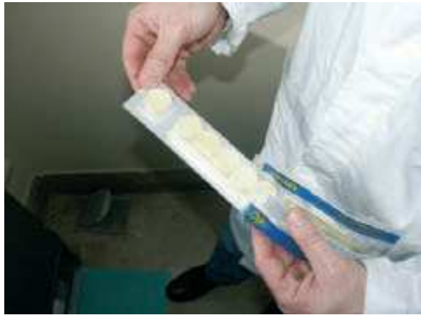
1. Open the bag