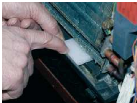
4. Insert the tablet in the drain pan