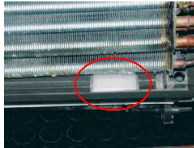
5. Assure that the tablet is positioned upstream of the drain hole.