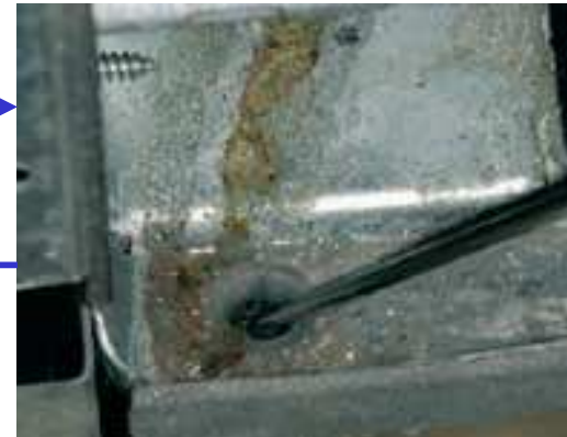
2. Mechanically remove any material clogging the drain hole