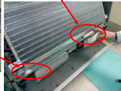
6. The tablets must be positioned at opposite sides of the drain pan.