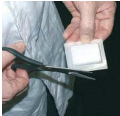
3. Trim the tablet's capsule in order to fit in the available space