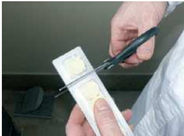
3. Cut the blister to separate one tablet from the other 5 tablets