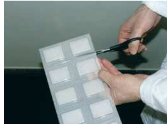
2. Cut the blister to separate one tablet