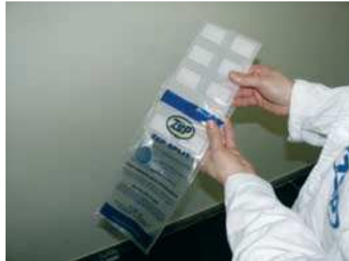
1. Open the bag