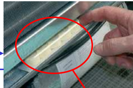
4. Insert the 5 tablets in the highest part of the condensate collector